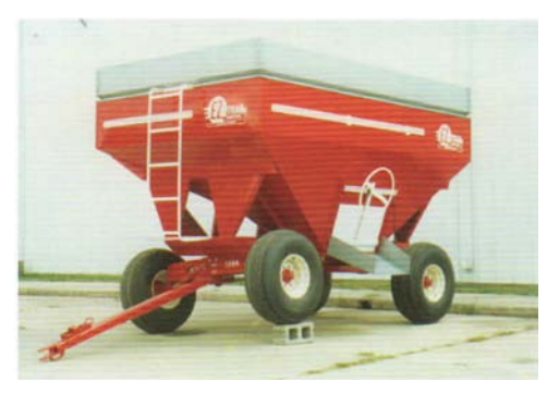
400 Bu. 8-1/2' x 12-1/2' on 1384B 14L x 16.1 tires. Welding shops have inquired about selling 116" our wagons because they weld & repair other brands of wagons but they seldom have to repair an E-Z Trail. The oscillating axles do make a difference.