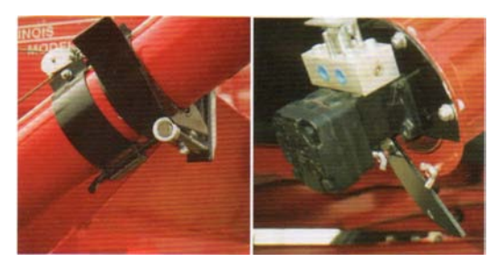
Standard features like brake winch, transport lock, and bottom clean-out door make the E-Z Trail hydraulic auger safe & E-Z to use on nearly any brand of gravity wagon!