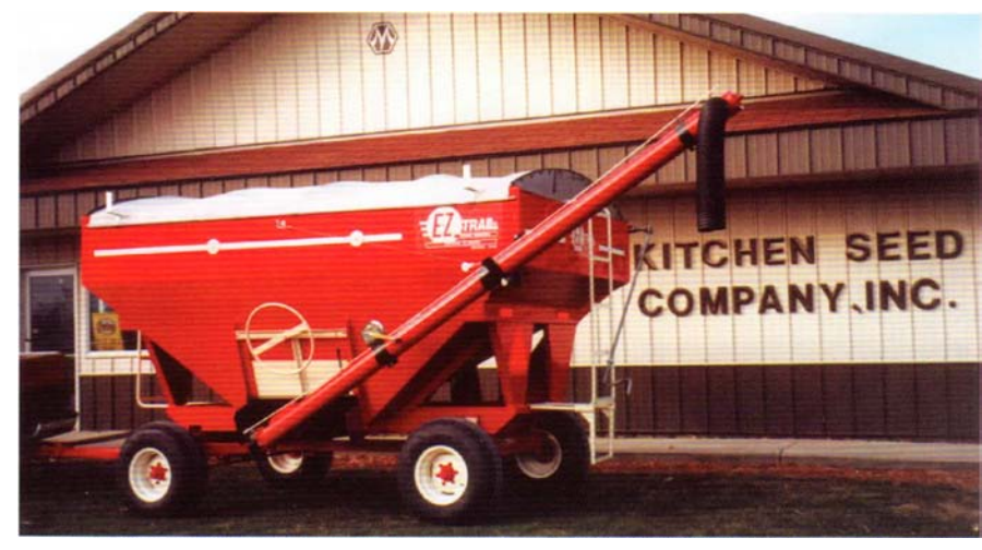
The optional cover has an 18 oz. reinforced vinyl roll tarp, stainless steel end caps, & Shur-Lok latch plate to keep seed dry at planting time. You can safely cover or uncover your seed in 30 seconds without climbing on the wagon. Since some "stretch & shrink" is normal, an optional rear ladder is the ideal holder for the roll crank. Proper tarp tension is easy to maintain by simply hooking the crank to a higher or lower ladder rung.